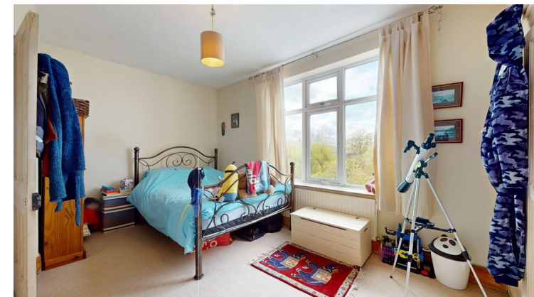
BEDROOM FOUR 4.50m x 3.12m (14'9 x 10'3)

Double glazed window, fitted double door wardrobe with high level shelf and cupboard above, panelled radiator.