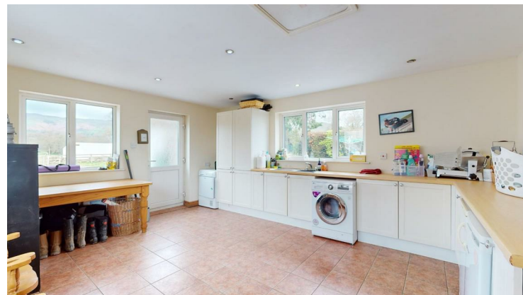
UTILITY ROOM 5.38m x 4.09m (17'8 x 13'5)

A very spacious room to the rear of the house with three double glazed windows, one of which affords far reaching views towards Moel Famau and the Clwydian Hills, it has a range of fitted base units with wood grain effect working surfaces and inset single drainer sink, plumbing for washing machine and space for fridge and freezer. Matching flooring to hall, double glazed door leading out.